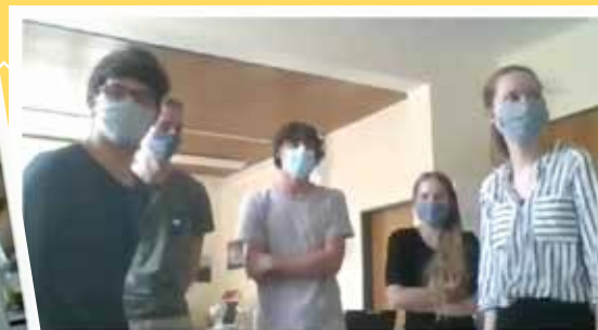
3. Place: Silverberg-Gymnasium Bedburg