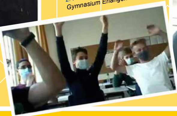
2. Place: Albert-Schweitzer-Gymnasium Erlangen