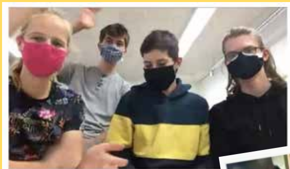
1. Place: Friedrich-Ebert-Gymnasium Bonn

The teams winning the first three prizes will venture on their price journey to Valkenburg, Netherlands, as soon as the pandemic allows it. There were also great prizes for the teams on the 4th to 10th place: calculators from Casio and math books from Springer Spektrum. We would like to thank both companies for their support! Furthermore, we would also like to thank the many volunteers, mostly Bonn math students, without whom such an elaborate and complex arrangement of this tournament would not have been possible.